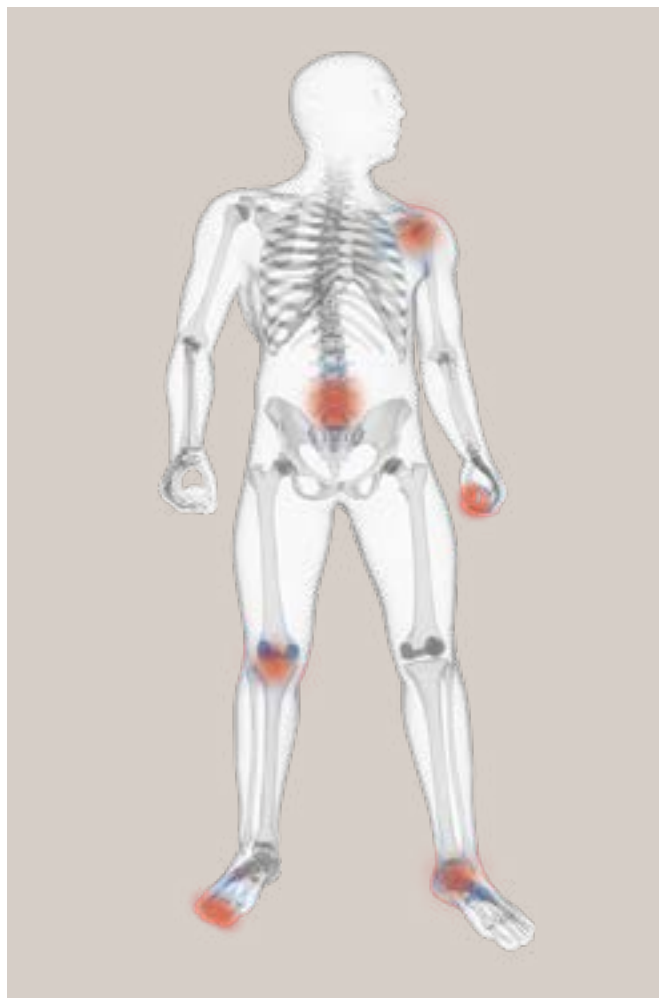
Figure 1. Joints affected in psoriatic arthritis