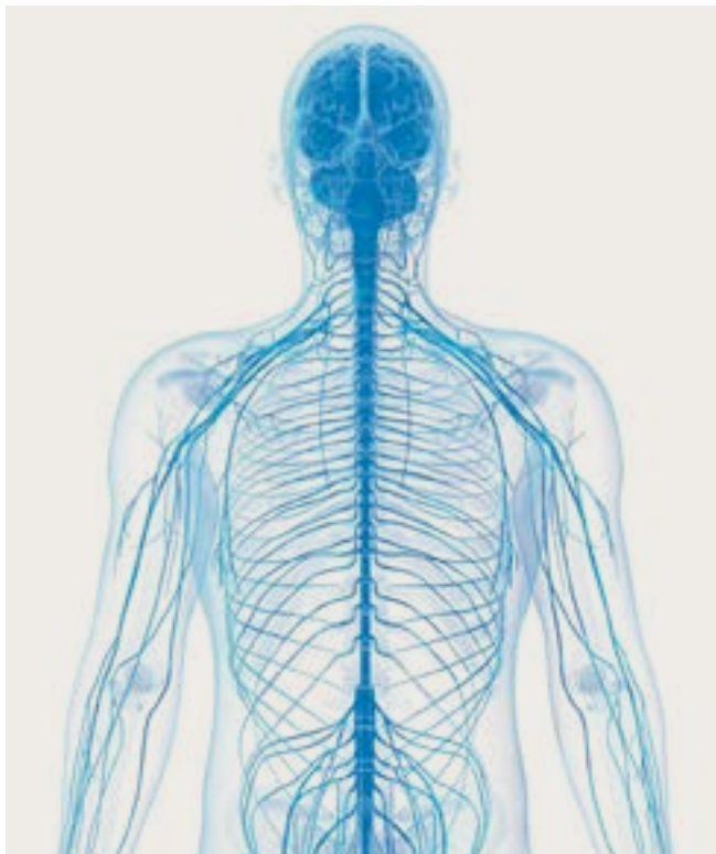
Figure 1. The central nervous system

MS is thought to be an immune-mediated disease. This means it occurs because of a problem in the immune system. Normally, the immune system makes antibodies that seek out and attack bacteria and viruses that might cause illness. In MS, the immune system mistakenly attacks the CNS. 1